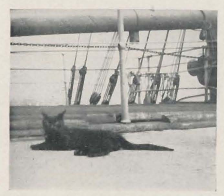
Tuttles on the Deck of the COLORADO

EDITOR'S NOTE: This month it is the cat-lovers' turn. Last month the doglovers had their say in an article entitled "Sea Dogs." Grace Isabel Colbron, one of the Institute's contributors, sends the following about a seagoing