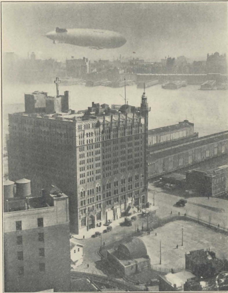
The present building of the Seamen's Church Institute of New York (dark portion), with the new Annex, which has a frontage of 49 feet on Coenties Slip and 155 feet on Front Street, and which will accommodate 1,000 men in addition to the 500 in the old building.