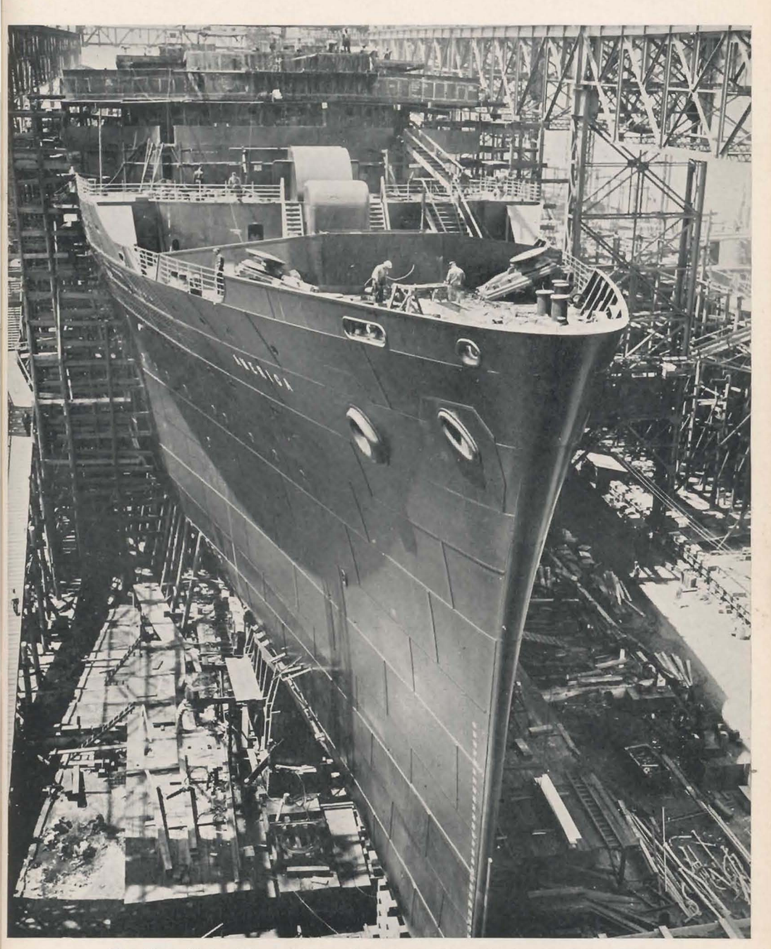
The New United States Liner "America", Launched Aug. 31, 1939.

THE SEAMEN'S CHURCH INSTITUTE OF NEW YORK VOL. XXX No. 10 OCTOBER, 1939