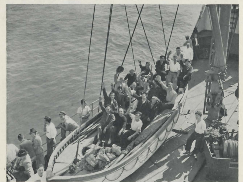
Rescue at Sea. Men of the ill-fated British freighter "Blairlogie" pictured in their lifeboat as they were rescued by the S.S. "American Shipper."

As THE LOOKOUT goes to press, thirty-two of the torpedoed British freighter Blairlogie, picked up by the S.S. American Shipper of the United States Lines, have arrived at the Institute. Like the Winkleigh they are in need of food, clothing, shaving gear and other necessities. The British consul sent them here, knowing that we always strive to have a well-stocked and asked to sign the official guest Slop Chest for all emergencies.