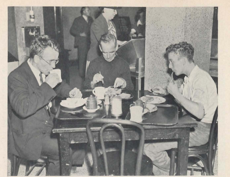
A scene in the Institute's cafeteria, where members of the crew of the torpedoed freighter "Winkleigh" enjoyed their meals.