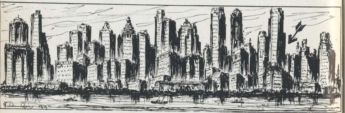
Drawing Contributed to the Institute by Hendrik Willem van Loon.

To help welcome thousands of seamen annually to the Port of New York, please send your contribution to the SEAMEN'S CHURCH INSTITUTE OF NEW YORK 25 South Street, New York, N. Y.