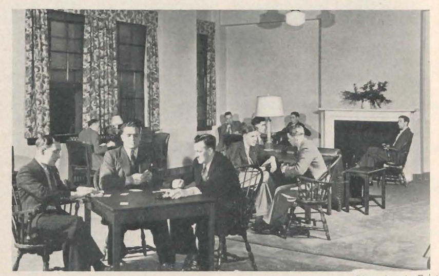
Cribbage, pinochle and bridge are popular games while British seamen are on shore leave in New York.

* See February Lookout for a further account of the San Demetrio.