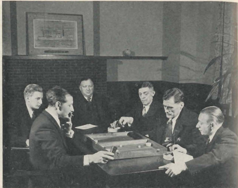
A tense moment in a lively game of backgammon in the new Belgian Club.