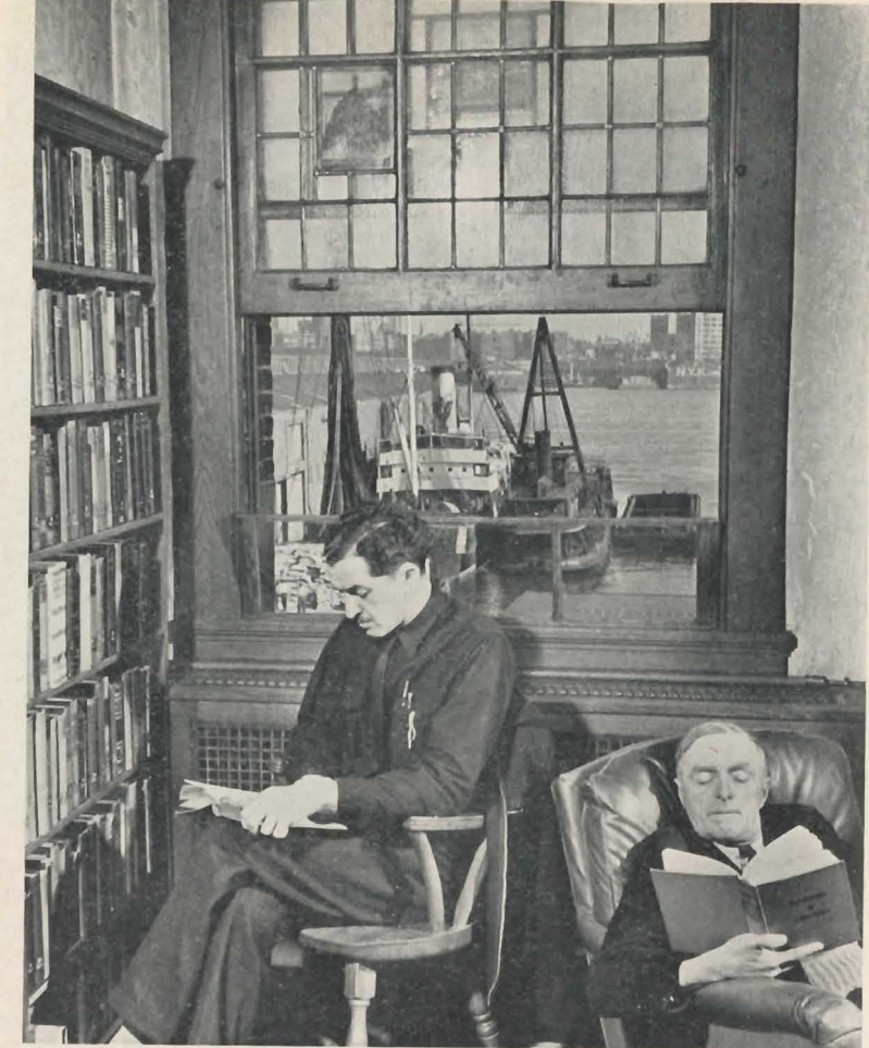
The window overlooking South Street brings one close to the bustle of shipping. Here the photographer has caught a glimpse of a little Icelandic freighter being loaded and Brooklyn Heights in the background.