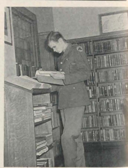
Members of the Signal Units of the U. S. Army which were quartered in the Institute in January, 1941, frequently used the Conrad Library.

Our Brittanica is of the vintage of 1911 and we greatly need a more recent edition, preferably, of course, the supplemented 1914 issue. The Americana is also in demand by readers, and the 1941 edition of this encyclopedia would be welcome.