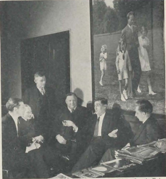
A group of Belgian seamen spin yarns in front of a photograph of their beloved King to whom they are

M. Gutt, speaking in Flemish, then in French, and finally in English, paid tribute to the courage displayed by Belgium's merchant seamen and their officers who sail their ships into the war zones, carrying important cargoes for England, under the supervision of the British Ministry of Shipping. These men cannot return to their homes in Belgium because of the Nazi occupation, and the club rooms will provide pleasant surroundings reminiscent of their homeland before the war. The Belgians asked for space in the thirteen-story Institute, which is the largest shore home in the world for merchant seamen of all nationalities. The Belgian seamen thus have access to the extensive facilities such as 1,600 dormitory beds and private rooms, commissary, baggage room, barber and tailor shops, laundry, seamen's funds bureau, social service bureau, writing room, clinics, merchant marine school, library, U. S. Post Office, chapel and many other activities