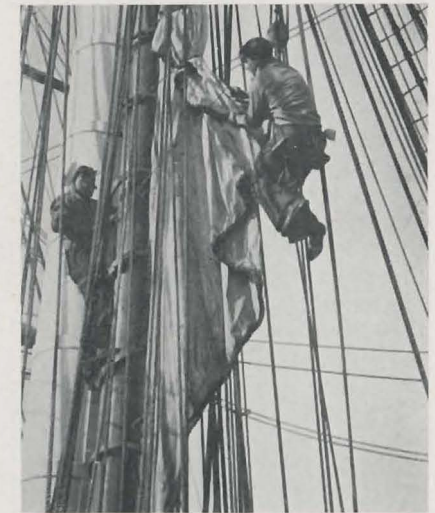
"Passing the Gasket" Aboard the U. S. Frigate "Constitution"