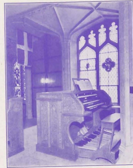
Organ Console, Chapel of Our Saviour