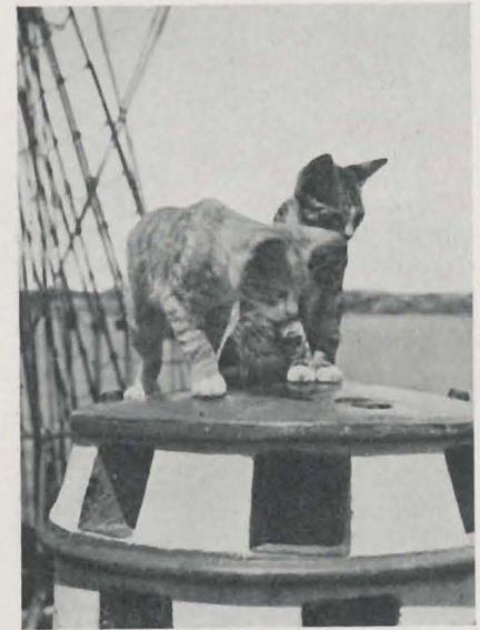
Joey and Conrad, the Ship's Cats Atop the Capstan