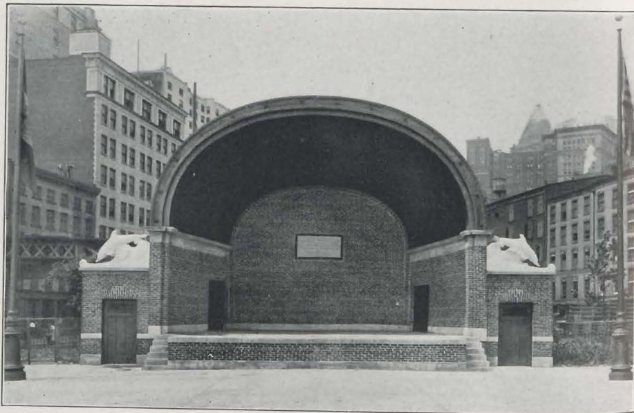
Merchant Marine Memorial Bandstand, Jeannette Park, Coenties Slip, opposite the Institute