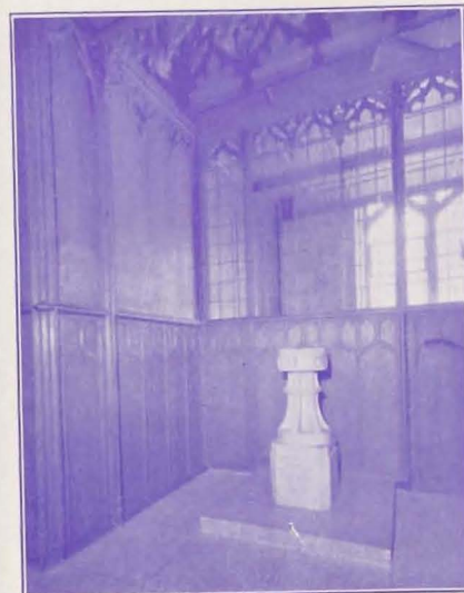
Baptistry, Chapel of Our Saviour

These inevitably cause suffering, and the Institute, neutral like the Red Cross, always needs money. Please have faith in ultimate and honorable settlements, and continue to help us.