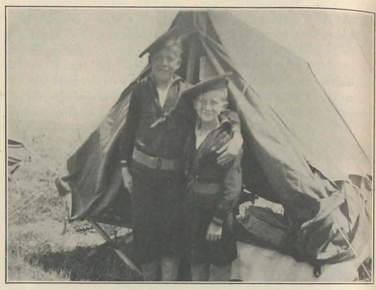
TWO OF THE INSTITUTE'S YOUNG HOPEFULS

The Institute has a new and most fascinating function.