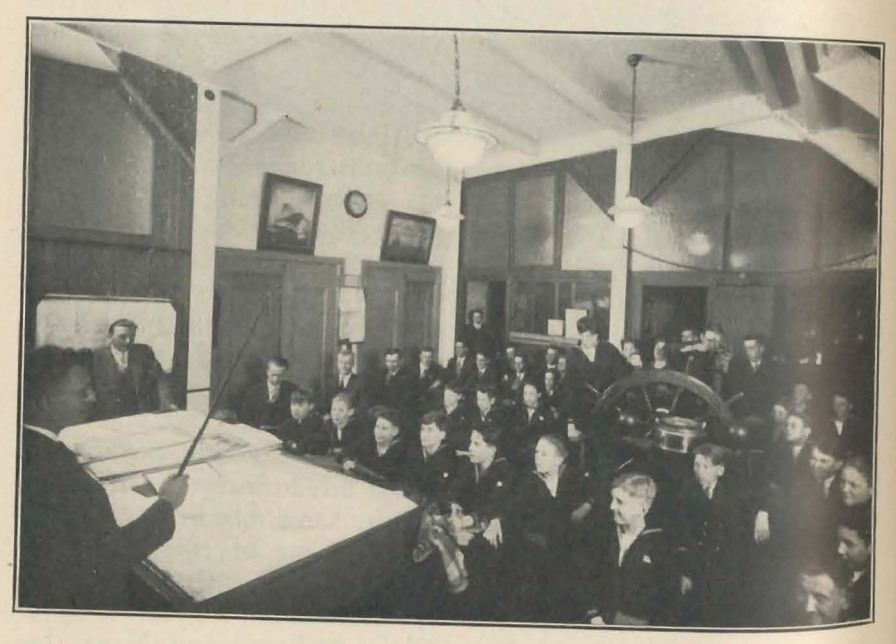
A LESSON ON THE COMPASS