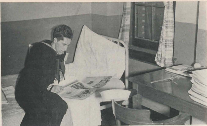
"A Room of One's Own"