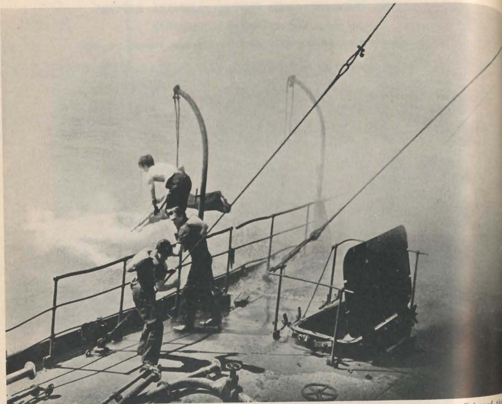
Passed by Canadian Censors (Official Royal Canadian Navy Photo—Released thru Universal Pictures for "Corvettes in Action"—from Acme.