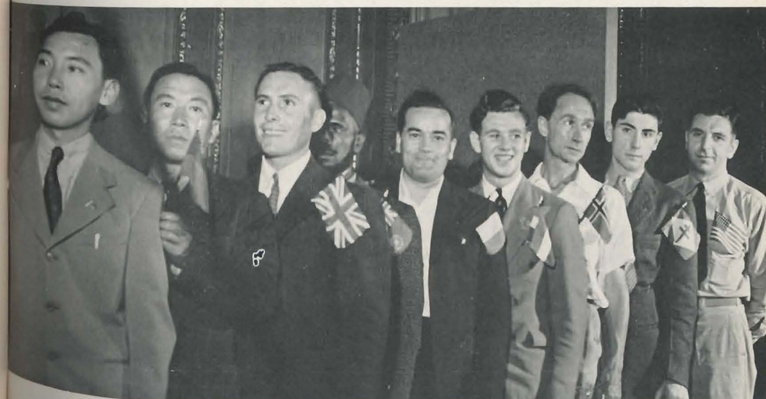
SEAMEN OF THE UNITED NATIONS PLEDGED TO "KEEP 'EM SAILING."