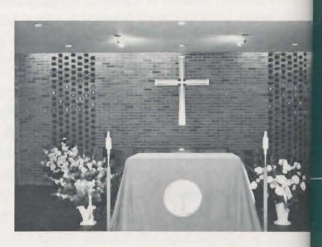
The Sanctuary of the Institute's Chapel of Saviour for seamen following the ecumen Memorial Service for the crew of the Mar Electric. During the service, a candle burned each of the 31 mariners who perished at sea the coast of Virginia on February 12th, 1983