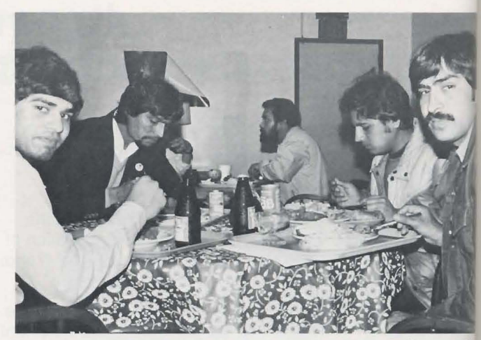
Members of the Taxiarhis crew enjoying a rare hot meal when the SC Ship Visitors brought them to the Institute.

With a limited staff and budget, the results achieved by the Seafarers' Services Division are commendable: 2,244 US and foreign ships visited in New York; 2,933 in Port Elizabeth/ Newark; nearly 70,000 books and magazines distributed portwide; 28,379 seamen from 55 nations entertained at the Seafarers' Club in New York and another 30,000 in Port Newark.