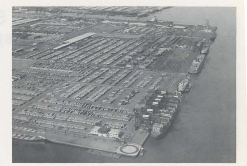
Piers in Port Elizabeth, N.J.

They haven't decided yet. But don't forget: one-third of EVERYthing.