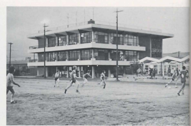
Seamen's Church Institute in New Jerse