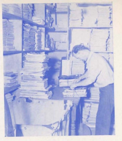
28,699 Books and Magazines Distributed to Seamen January 1st to July 1st, 1937.