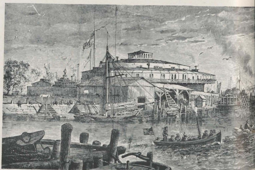
A View of Castle Garden, now the Aquarium, showing many types of old harbor craft in lower Net bay, 1869; for example: a sloop; a steam launch; a Whitehall boat; a canal boat; a square-rigged

Kindly send contributions to the SEAMEN'S CHURCH INSTI-TUTE OF NEW YORK, 25 South Street, New York, N. Y.