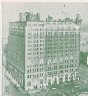
"25 South Street"