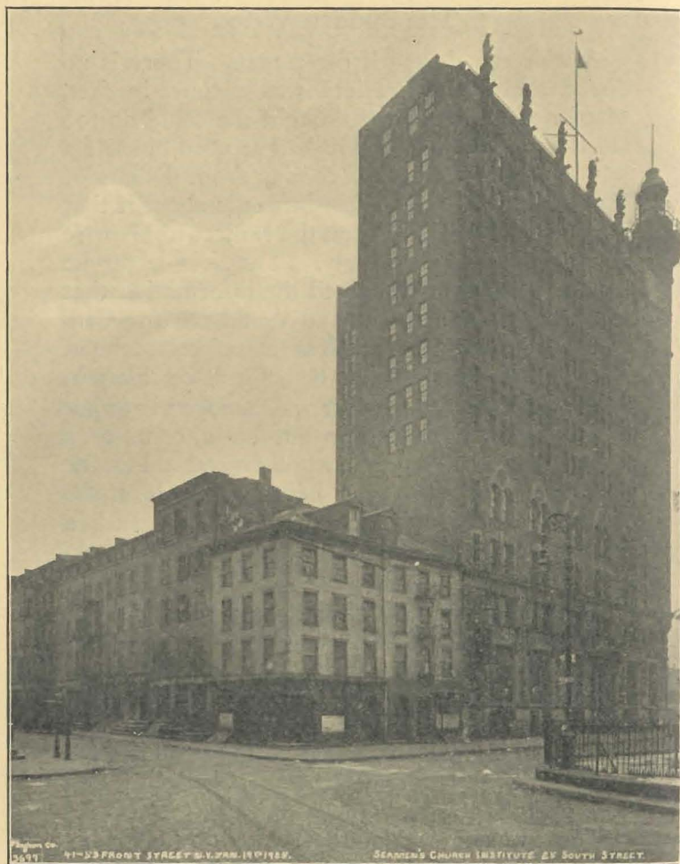
The Institute from Front Street in January, 1925, Before the Buildings, 41-53 Front Street, Were Torn Down.