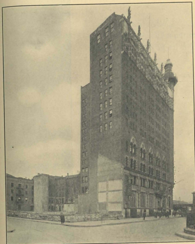
The Institute from the Same Position on April 13, 1925, the Day Work on the New Annex Was Begun.