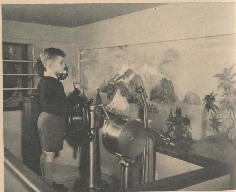
The nursery on the QUEEN ELIZABETH is a miniature bridge with steering wheel, and engine room with apparatus to amuse small fry. As a lad steers the wheel a moving panel shows changing scenery. There is also a speaking tube so the "captain" may give orders to the "engineer".