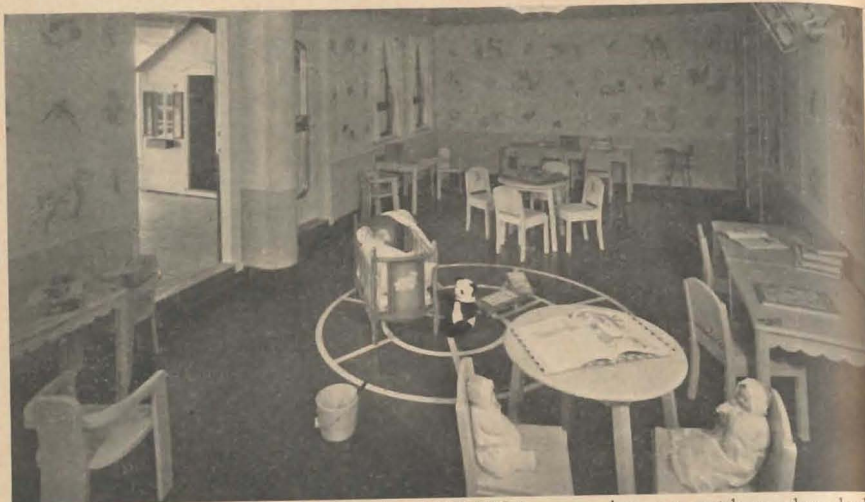
The first class playground on the AMERICA opens into an outdoor play deck with no exit for little folks to scramble out of. Murals are by Allen Townsend Terrell, (a member of the Institute's Artists & Writers Club Committee.) Hundreds of panels depict flowers, birds, fish and animals to hold the youngsters' attention.

THE United States liner AMERICA and the Cunard-White Star liner QUEEN ELIZABETH both have interesting accommodations for boys and girls who are privileged to travel on board these mammoth luxury ships.