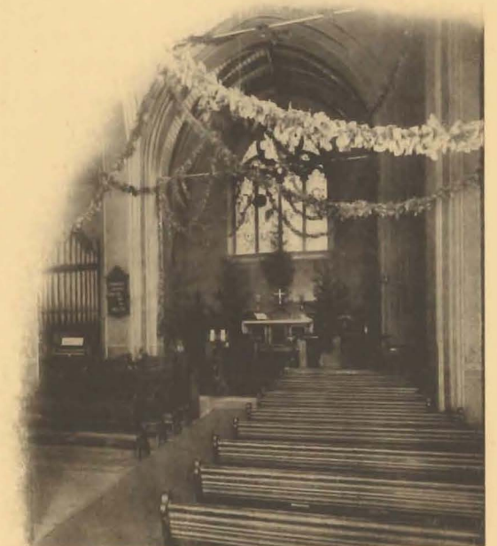
CHAPEL OF THE HOLY COMFORTER