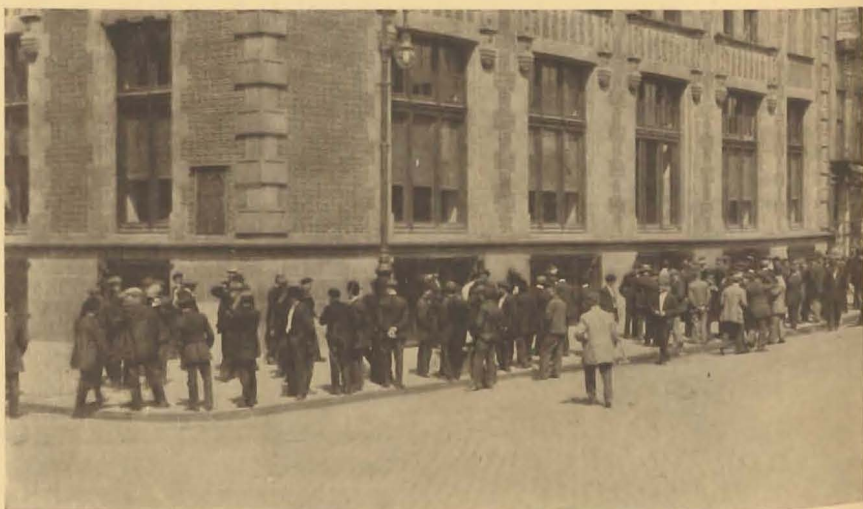
DURING SHIPPING HOURS, SOUTH STREET ENTRANCES

Attention is called to the more detailed reports appearing on the following pages.