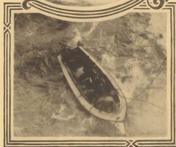
THE DORY ALONGSIDE THE STEAMER WHICH CAME TO THEIR RESCUE