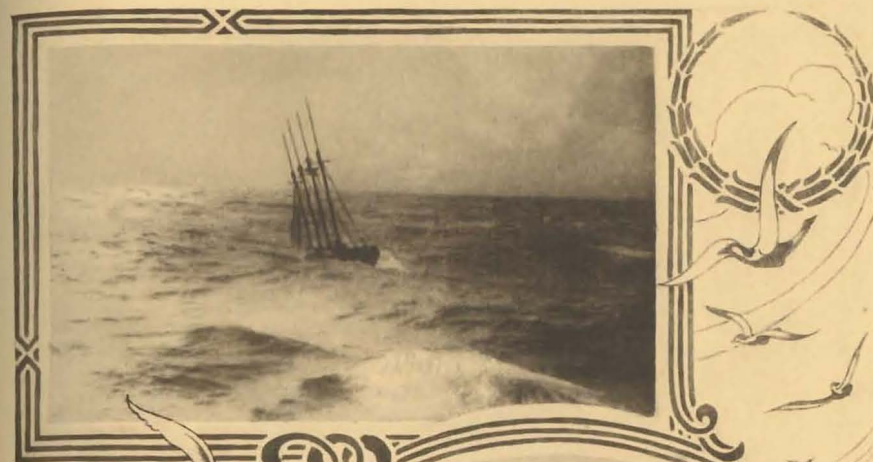
The four-masted Schooner "Marjorie Brown" lost on way from Newport News to Boston