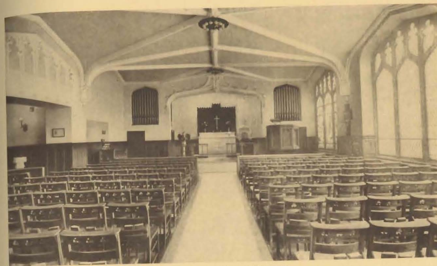
CHAPEL OF OUR SAVIOUR