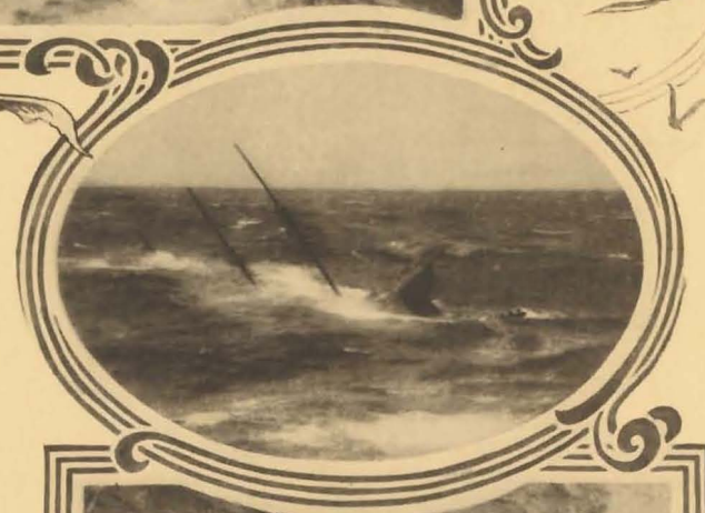
The pictures show three stages of this disaster.