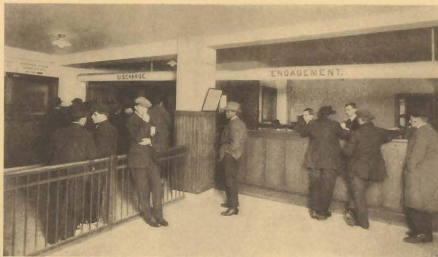
BRITISH CONSUL'S OFFICE