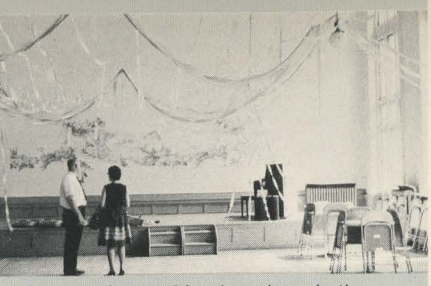
New scenic mural has been hung in the auditorium, while the rear of the room is being re-designed for convenient serving of beverages and snacks.