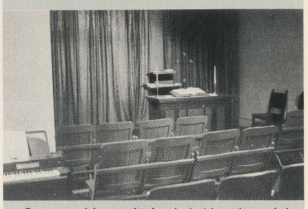
Prayer and hymn-singing is held each week in the small chapel reached from the lobby. A portable organ is taken aboard ships for special occasions.