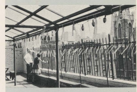
Spacious roof with spectacular night view of city is center of social activities during warm summer months.