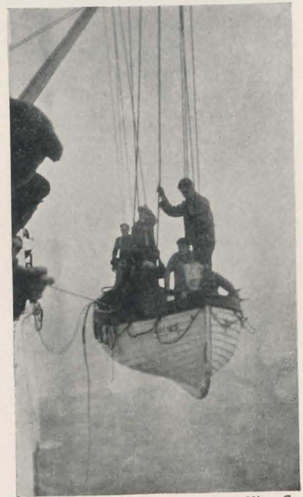
Survivors of the Nantucket Being Taken Aboard the Olympic

Behold those banners blue and red Which augur better days ahead And don't forget the colors bright An eagle on a field of white. Perforce this Royal bird will squawk, With talons he will tear and talk. Whoever thinks he does not mean He must be heard as well as seen 'Tis plain there is a law of life That all men must observe If we do not adhere to it No mercy we deserve. Come! Play your part then— Do your bit— There's but one life to live So don't be Scotch, wear rubber heels They're soft and always give.