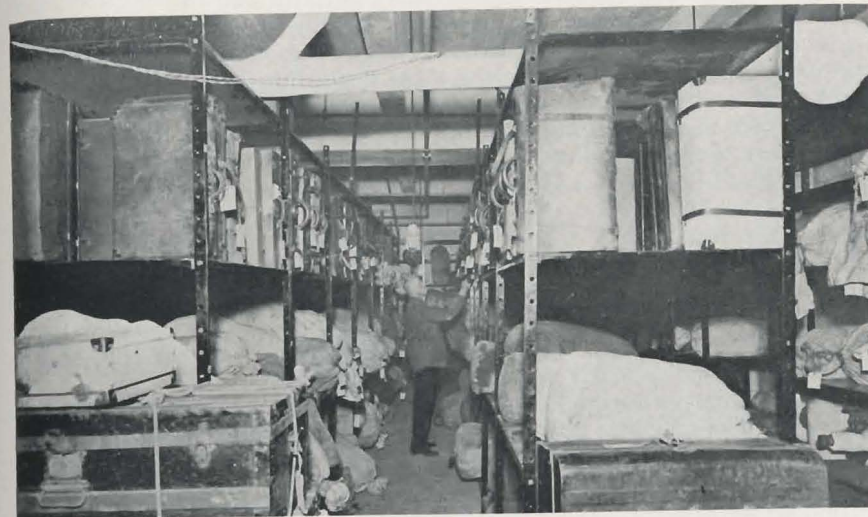
Baggage Room at the Institute

IN the old days of the Spanish Main, of lusty pirates and buccanniers, the treasures of the crew were stored in some secret cavern, guarded by trusted members of the band. If buried, their location was charted, and their owners, confident of their safety, went out in search of additional plunder.