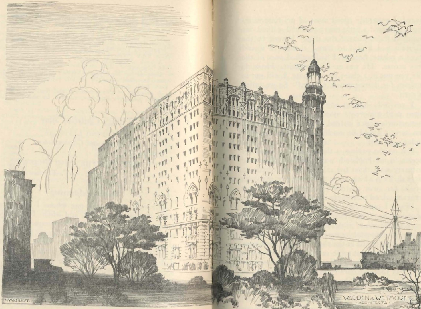
The Seamen's Church Institute of New York will appear when the Annex is completed. Its completion and furnishing approximately $2,500,000.