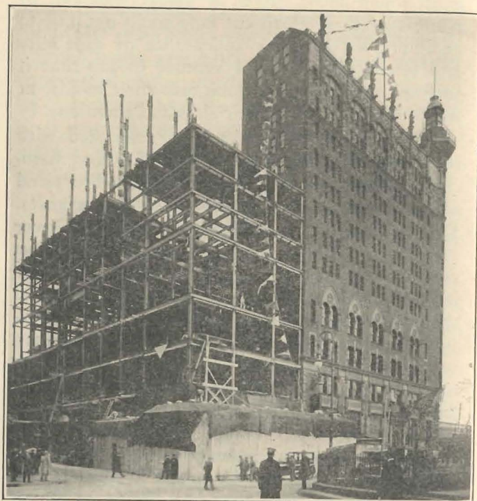
The Institute as it appeared November 5th, 1925, the day the cornerstone was laid.

The ceremony took place in the enclosed portion shown in the immediate foreground.