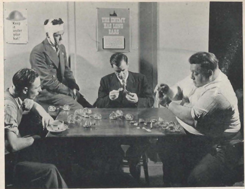
Getting through a little bottle-neck. American seamen put ships inside tiny bottles and sell them for 50c each for the joint benefit of the Seamen's Church Institute of New York and Bundles for Britain.

from the Forty-Second Street Property Owners and Merchants Association the Institute moved its workshop and display of marine paintings and handcrafts from the waterfront to midtown Manhattan so that more people might have an opportunity to admire and purchase the sailors' work.