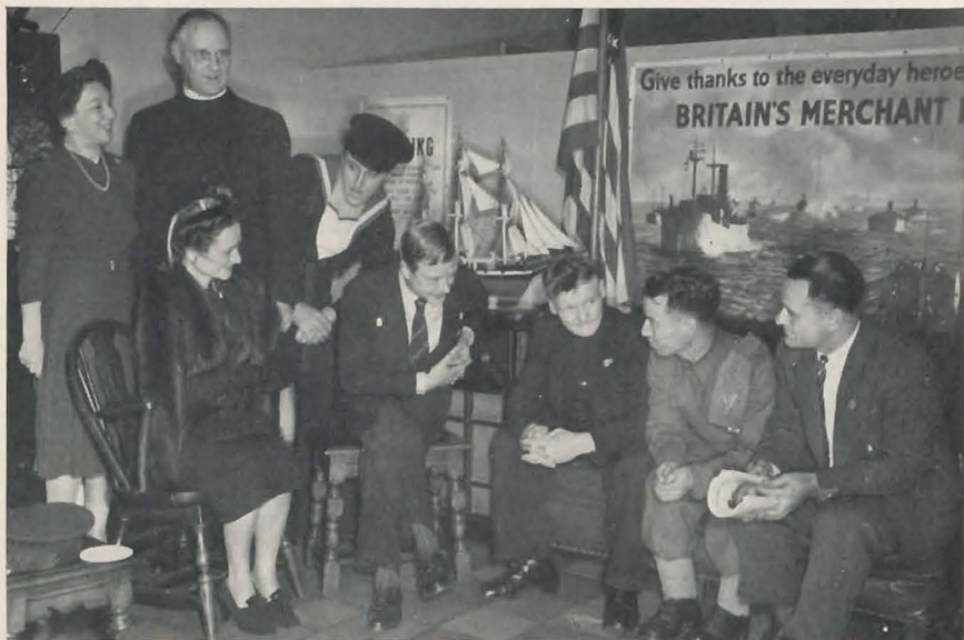
A Duke Listens to a Sailor's Yarn

Although the number of celebrities visiting the Institute since the war began, including Her Royal Highness Crown Princess Juliana of Holland and Viscount Lord Halifax, would seem to make the seamen calloused, they were as excited and enthusiastic as ever in their reception of the Duke and Duchess of Windsor. The pleasant aspect of the visit was made possible by the atmosphere of informality and friendliness which characterizes the British Merchant Navy Club. Merchant seamen are laboring strenuously to hold the forces of civilization together and they have a most sincere respect for those in places of leadership.