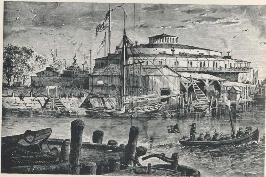
Reprinted from The Art Supplement to Appleton's Journal Castle Garden 1869

its crescent-shaped coastline forming Battery Walk, when the Park was less than half its present size. Back in 1807 the United States Government planned a fort for this offshore reef. It was called Southwest Battery, then Fort Clinton and, after the War of 1812, Castle Clinton, to honor the Mayor of New York. It goes down in history as a fort that never fired a gun against an enemy.