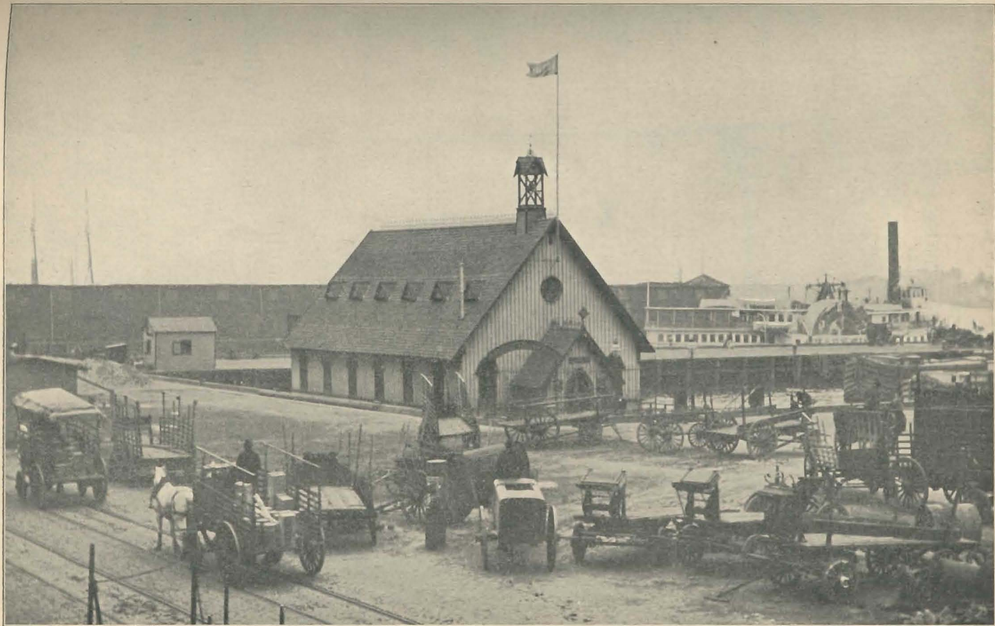
Floating Church of Our Saviour, Between Pike and Rutgers Streets, East River.