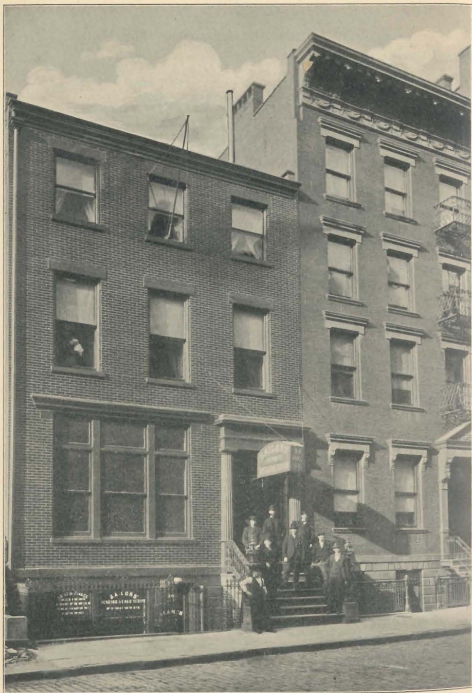
Mission House and Reading Room, 34 Pike Street. Chaplain's Residence.