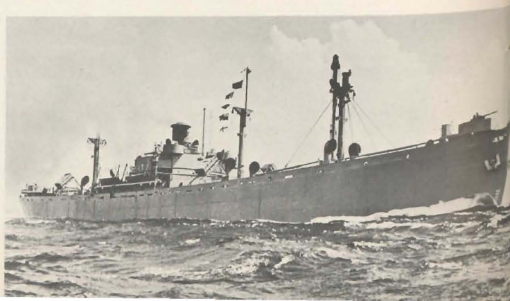
A Liberty ship similar to the Stephen Hopkins