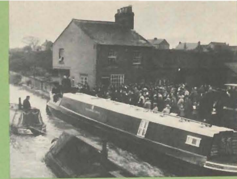
Salvo cruises Britain's inland waterways all year 'round.