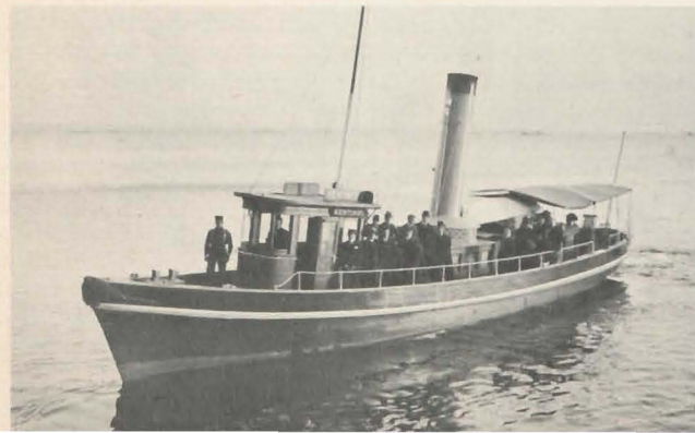
The Sentinel , first launch operated in the service of SCI in New York Harbor.