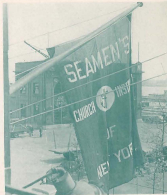
The Institute's house flag flies over the main entrance to "25 South Street"