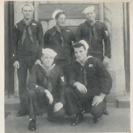
A Group of U. S. Coast Guard men at the Seamen's Church Institute of New York while awaiting orders to take over merchant ships for the U. S. Navy.

The Institute is glad that it is so equipped that it can help in defense work and we are sure that our contributors will support the decision of the Board of Managers to make available our facilities to men of the Army as well as the Coast Guard and Merchant Marine. We know that our friends appreciate that the indispensable, intangible element in our national defense is Morale . To quote General George C. Marshall, Chief of Staff of the U. S. Army in appealing for proper recreation facilities for the Army: "No matter how fine your equipment, no matter how abundant, if