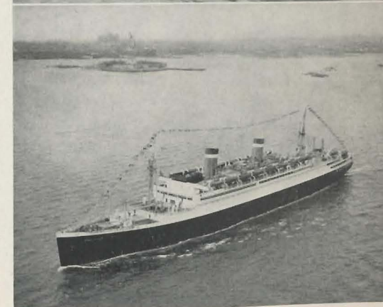
Reading from top to bottom: SS. AMERICA, SS. MANHATTAN, SS. WASHINGTON.