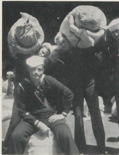
Coast Guard sailors carry their "donkey's breakfasts" into 25 South Street, but do not have to use them as the Institute beds are very comfortable.

Applying this also to our merchant marine, sea power is useless without man power, and man power however well trained, cannot function without good Morale . We are proud of our merchant service and know that it is running the risks