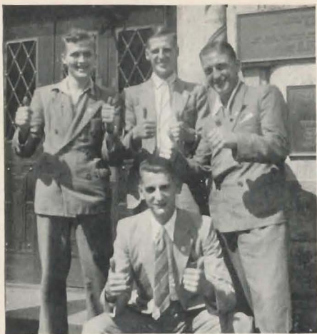
Torpedoed seamen of British freighter "Ena De Larrinaga" say "Thumbs up!"

and eventually may require an expert in admiralty law to decide which crew won the bet. The two boats separated after six days since traveling alone might lead to an earlier rescue. Four days later one boat sighted the Brazilian freighter Almirante Alexandrino . The nineteen seamen were rescued and taken to the mainland.