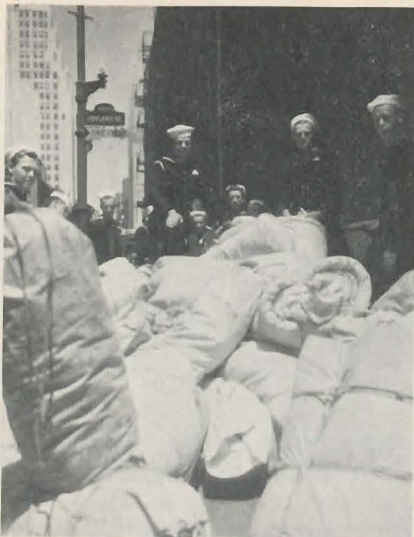
Hundreds of sea bags piled at the rear entrance to the Institute block traffic as Coast Guardsmen arrive.