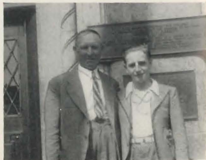
Oldest and youngest members of the crew of the "Ena De Larrinaga"—bos'un and cabin boy.

Special entertainments were provided the crew of the Ena De Larrinaga at the British Merchant Navy Club on the second floor of the Institute and they enjoyed the moving pictures in the Auditorium. The English Speaking Union also gave them a party in their headquarters at Radio City.