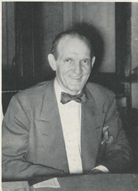
"And when they know I know, that saves a lot of nonsense."

Through close cooperation with Bellevue and the U. S. Public Health hospitals, the Bureau has gained referral privileges.