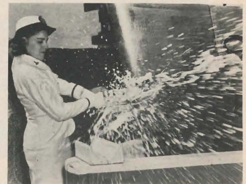
From keel-laying to launching — 32 days.