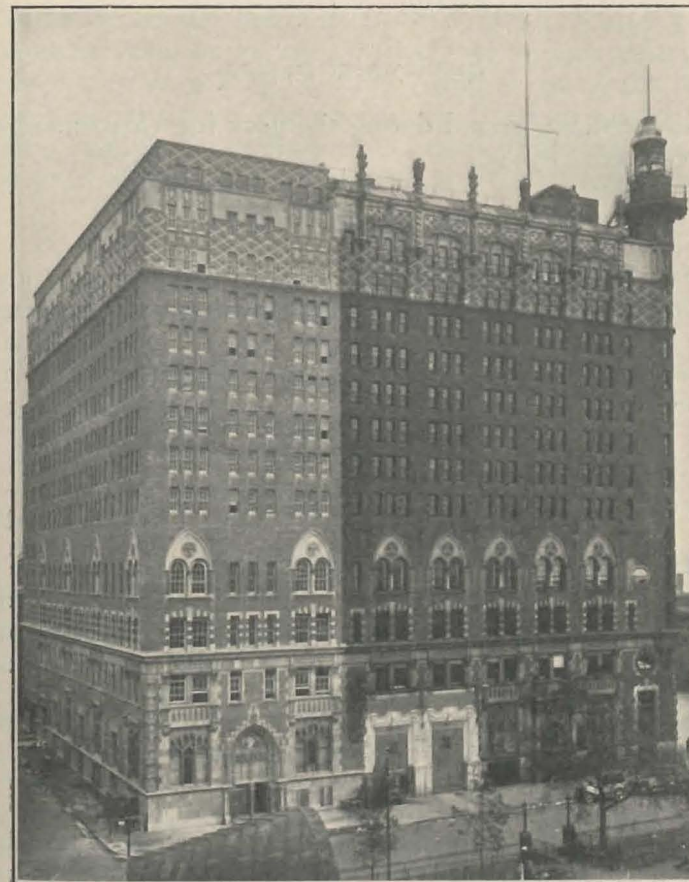
THE PRESENT BUILDING OF THE SEAMEN'S CHURCH INSTITUTE OF NEW YORK COMPLETED IN 1929 IS LOCATED ON THE EAST RIVER AT 25 SOUTH STREET