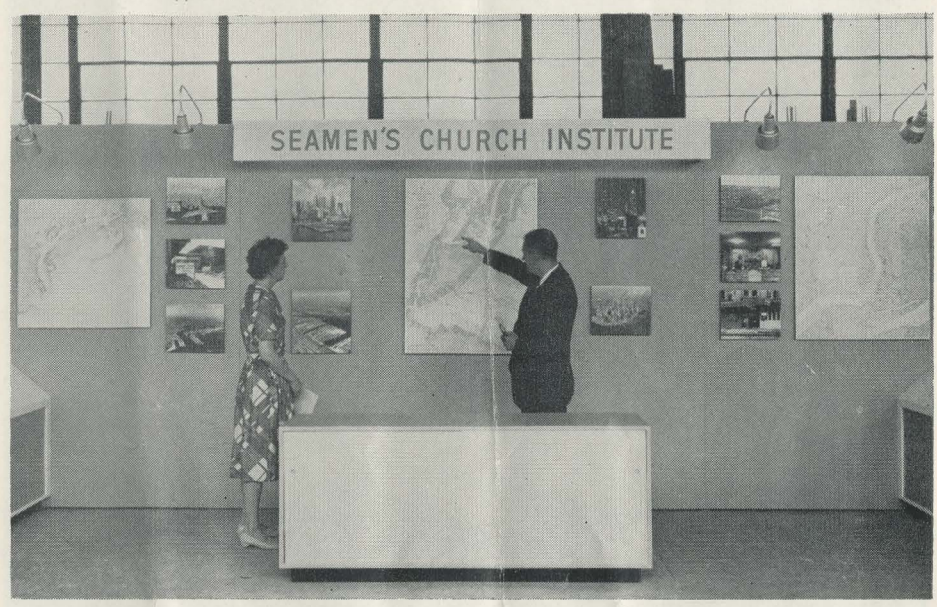
SCI display booth which will be used at the 1961 General Convention in Detroit.