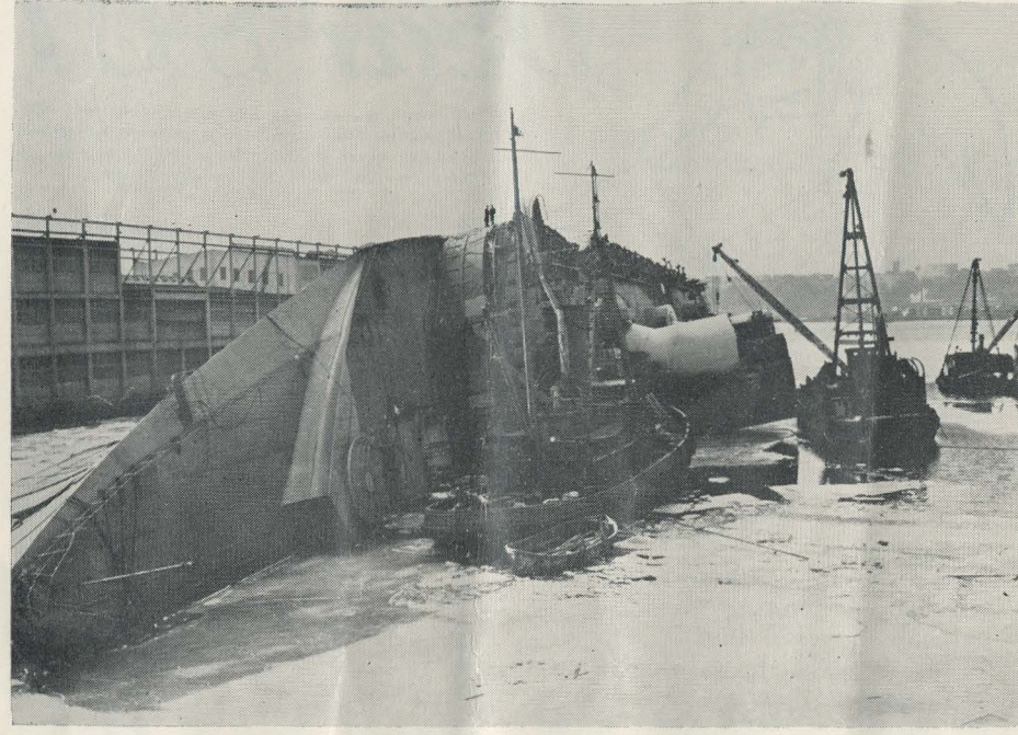
Some 2500 suggestions for salvaging the NORMANDIE were submitted, from placing ping pong balls in her hull to cutting up the ship at the scene. One cartoonist suggested toy balloons be tied to the deck.