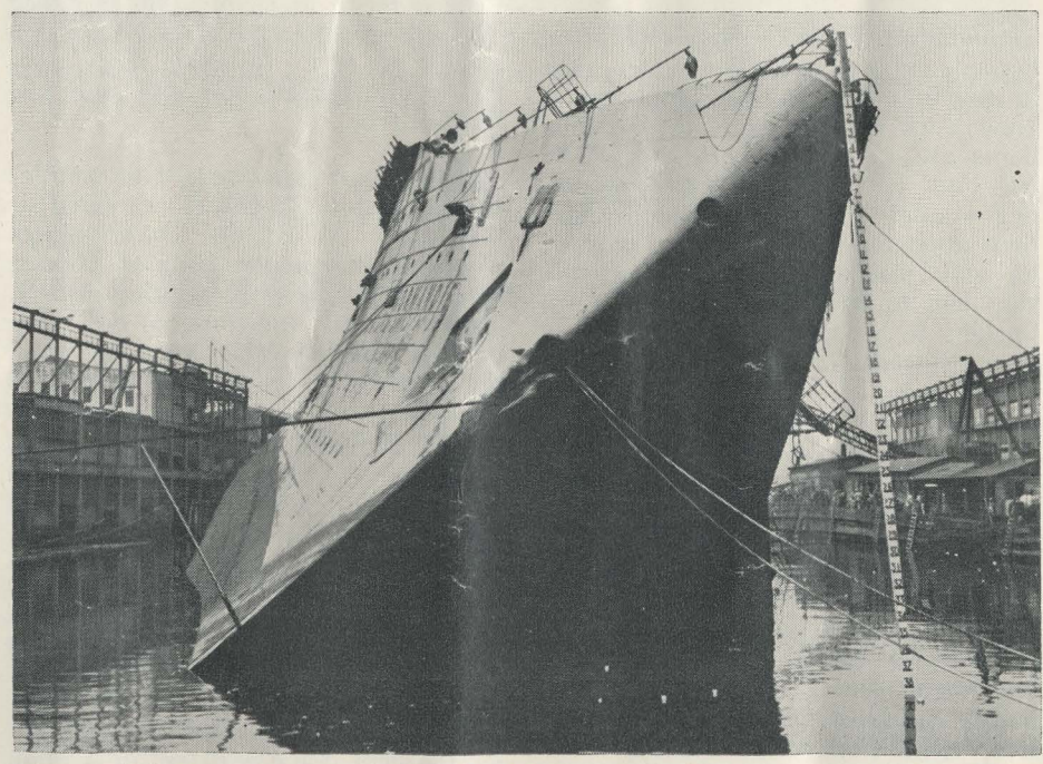
Divers patched 356 open ports and sealed off all deck openings with patches of steel and wood. The largest patch weighed 52 tons, was 54 feet long, 22 feet wide, three feet thick. Some 93 pumps sucked out water. She was freed September 15, 1943, almost a year and a half after she went down.

Ship salvaging probably began with the first prehistoric boat. When sea commerce began to flourish, storms and pirates scuttled many ships which lay up-ended like ghost fleets beneath the sea. Much valuable wreckage was thus cast ashore for lucky beach-combers. So intriguing did seaborne gifts become that when wrecks did not come fast enough "false lights" a crime since Roman days) were shown to invite passing ships to crash on treacherous rocks.